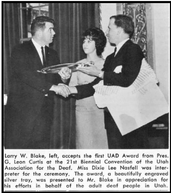
UAD Bulletin, Fall 1965